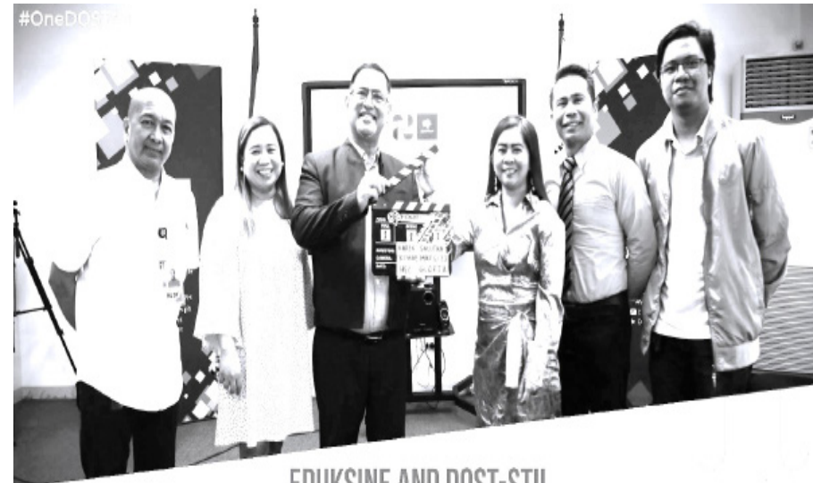
EDUKSINE AND DOST-STII MDA SIGNING DECEMBER 12, 2022

December 12, 2022, both parties signed a Memorandum of Agreement (MoA) which aims to strengthen and promote S&T by showcasing different programs of the DOSTv in the EdukSine website and applications.